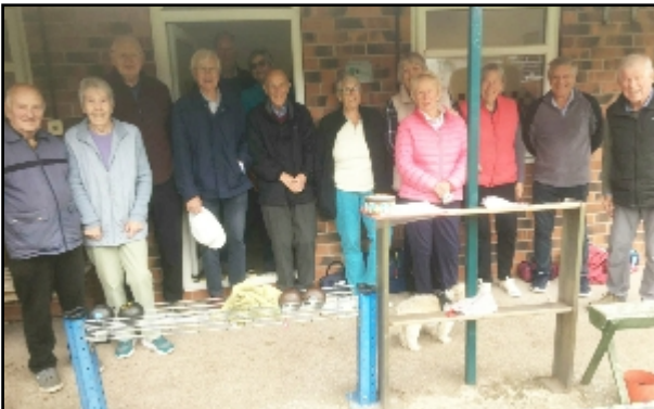
Owls group final afternoon of the season