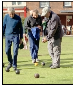
Larks morning group